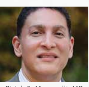
ASLMS 2019 Co-Chair

April 29 - May 3, 2020 | Phoenix, Arizona